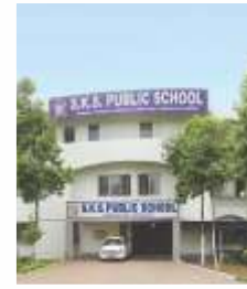
S.K.S. Public School Raniganj