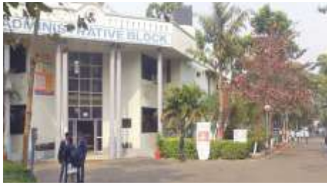
Bengal College of Engineering and Technology, Durgapur