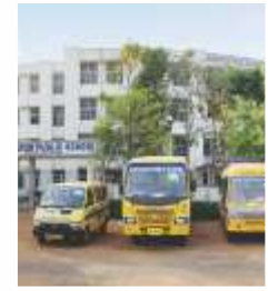
Durgapur Public School Durgapur