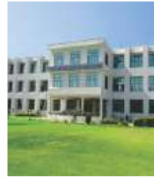
Sanjay College of Pharmacy