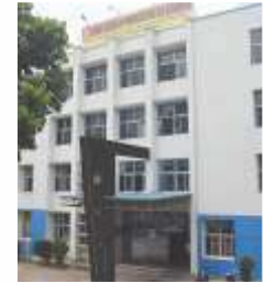
Bengal College of Pharmaceutical Sciences & Research, Durgapur