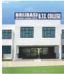
Brijbasi Education & Welfare Society, B.T.C. College