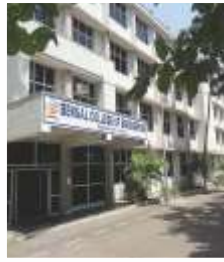
Bengal College of Engineering, Durgapur