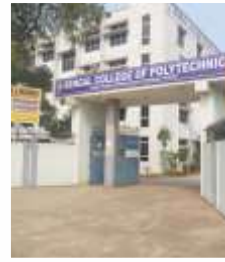
Bengal College of Polytechnic, Durgapur