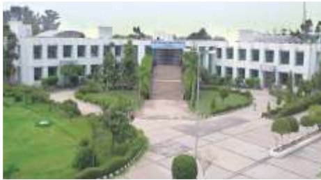
SKS Ayurvedic Medical College and Hospital, Mathura